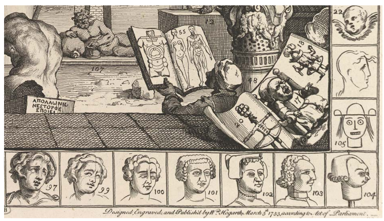
Figure 7: Detail of Figure 6.

You can see how the face on the far left has much drama and emotion, and then you go through this progression of different faces to the right of it. The less realistic a face looks, or the less human-like the face looks, the fewer curves it has in the drawing. It just becomes much more linear.