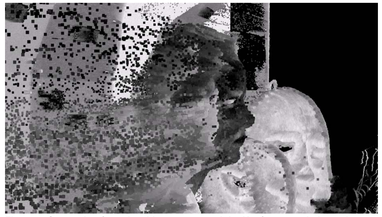
Figure 5: Screenshot from the video Laserportrait im Kopfscanner. Artist: Lukas Einsele.

That question inspired me to apply some strange new visualizing technologies, such as 3D photogrammetric visualization or laser scanning. These technologies don't show you what is there, they show you what is not there – that there is something you don't see. I would like to share an example that might help you understand what I'm talking about.