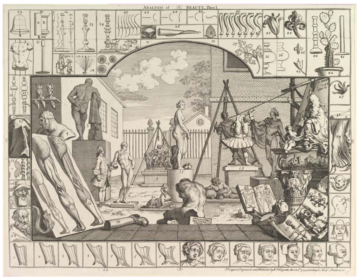
Figure 6: Plate from William Hogarth's "The Analysis of Beauty."

the relationship between faces and humans.