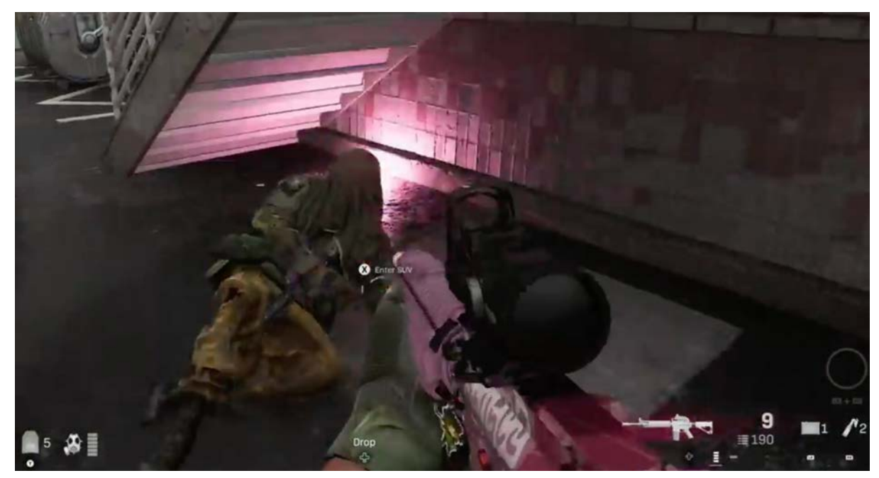
Figure 7: Screenshot from "Call of Duty"

What you see is from the perspective of one of the fighters, with a gun in his hands, chasing for enemies. When two hostile persons meet in the game, then they shoot and try to kill each other. Call of Duty is rated for 18-year-old people. With certain settings, however, it can be down-aged. In one such setting a person's body "vanishes" from the game as soon as it is killed. Another setting puts a cloth over the face of the enemy so that you do not see his face while killing him. This is just my reaction to the question.